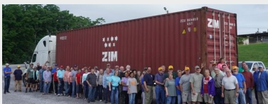
Container loaded with mattresses & supplies headed to Israel

Donations will be received Monday—Friday, 9 AM—3 PM at God's Warehouse, 3441 W. Andrew Johnson Hwy, Morristown, TN 37814