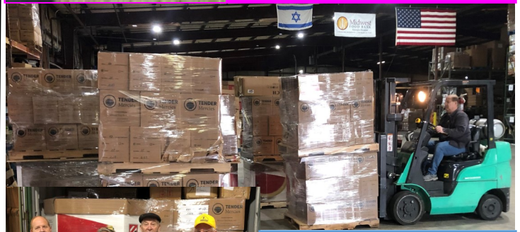
God's Warehouse recently loaded their first container with medical supplies and Tender Mercies Meals to be shipped to Turkey.