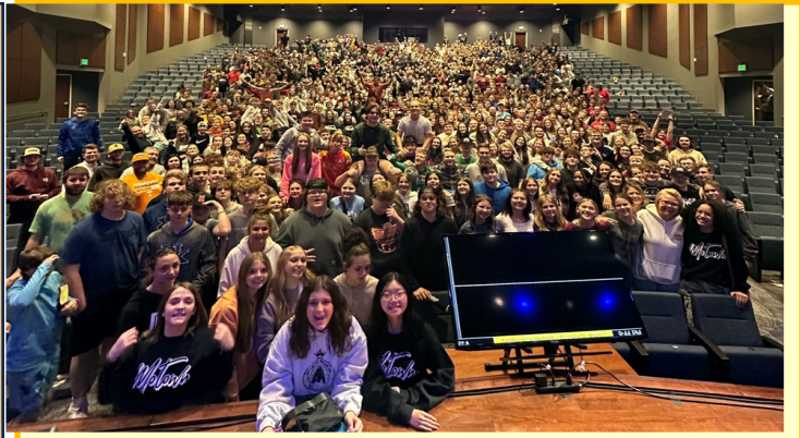
Lakeway Christian Academy in Morristown hosted Motown Madness in February. Almost nine hundred were in attendance representing 19 churches. Teens gathered to worship, share the gospel, pray, meet in small groups, work on mission projects and have fun. Thank you to all who made this weekend possible.

April 29th, 9 am — Noon Wallace Memorial Baptist Church 701 Merchant Drive Knoxville, TN