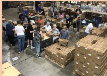
Formula to Hawaii