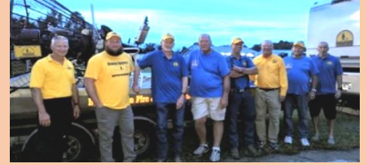
Swift water/drone rescue

God's Warehouse has been busy with ministry. In the photo on the top right, the Swift Water/Drone Rescue Team was called to Florida in preparation for Hurricane Idalia. Container #9 has arrived in Ukraine and the contents have been distributed (middle right). On September 1 truck load #1 was shipped to Marianna FL with relief for the hurricane victims. September 2nd, Containers #99 and #100 were packed and shipped for Harvest of Israel. Approximately 80 volunteers gathered to celebrate. At the end of August, 30 volunteers stamped 70 pallets of baby formula and one container of formula has been shipped to the wild fire victims in Hawaii. Last, but certainly not least, a 125 KAV diesel generator is ready for service. Thank you to all of the volunteers who helped with these projects and the many others that occur daily, as well as to all who give so generously to this ministry.