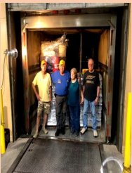
Load #1 to Florida