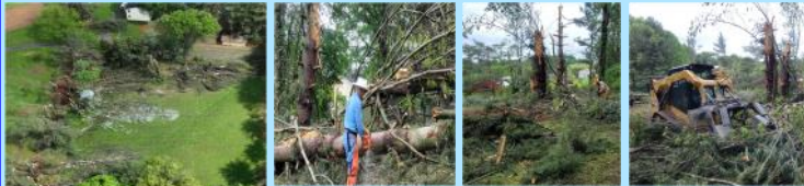
Dale Moles led a team in Tazewell to assist Cumberland Gap Association with damages from the same storm.

Volunteers from Nolachucky's Disaster Relief team were called out to remove more than 30 trees that were broken and down from the storms that passed through the Russellville area May 8.