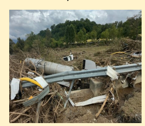
Debris with tanker truck near I-26 in Erwin.