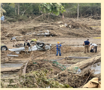
Swift Water Rescue Team searching near the Nolichucky River, Unicoi County.